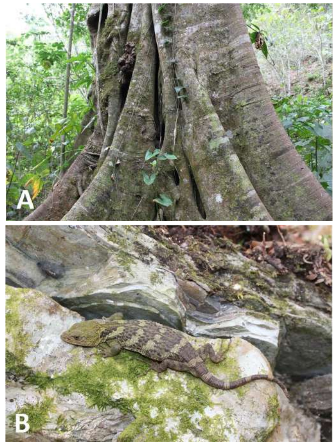
FIGURE 3. A) A previously unknown microhabitat type for Xenosaurus newmanorum (tree crevices) at the Casas Viejas locality. B) Female X. newmanorum SVL 132 mm encountered at Casas Viejas.