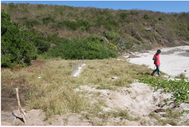
FIGURE 2. Vegetation types within dry forest during the early dry season in Cocinas Island.