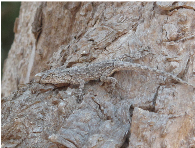
FIGURE 3. Adult male Urosaurus bicarinatus from Cocinas Island. Specimen (CIB 4291) perching at the base of a 2 m height cactus.

As mentioned above, these observations represent the first definitive record of Urosaurus bicarinatus on Cocinas Island, although CONANP (2008), in a technical report, mentioned the possibility that this species occurred on the island. Currently there are several hypotheses for the arrival and colonization of flightless vertebrate groups in islands; and probably this was also the case for U. bicarinatus (Casas-Andreu 1992). First, this species was present along an outer portion of the Pacific-facing mainland that later did separate during a tectonically active period that eventually formed the island (Carlquist 1965); second, this species actively dispersed to the island from mainland when a land bridge formed during the Pleistocene (Casas-Andreu 1992); third, many small species of reptiles and mammals such as U. bicarinatus