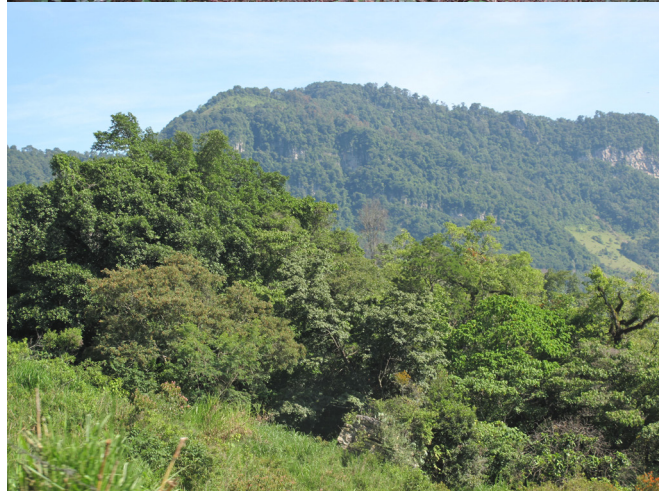
FIGURE 3. (A) Landscape of cloud forest in the Municipality of Tepehuacán of Guerrero, Hidalgo. (B) Cloud forest habitat where D. chloroticus was found.