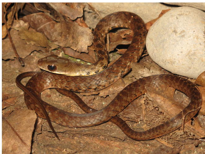
FIGURE 2. Drymobius chloroticus (subadult male) from the Municipality of Tepehuacán of Guerrero, Hidalgo, Mexico.

under approved scientific permit from SEMARNAT (# SGPA/DGVS/02726/10). The specimen has a SVL of 272.9 mm, and a total length (TL) of 408.3 mm. The main morphological characteristics of the snake include 2 internasal scales, 2 prefrontals, 1 frontal, 1-1 supraoculars, 1-1 parietals, 1-1 loreals, 1-1 preoculars, 2-2 postoculars, 1-1 anterior temporals, and 1-1 posterior temporals (Cope 1886). The dorsal scales are 17-17-15 in arrangement; the ventrals are 153, and the subcaudals 118. This snake has a long and slender body, with a tail about 33% of the TL. The dorsal color pattern in yellow-brown with 23 dark patches on the vertebral and lateral regions of the body, the ventral surface is cream in color, as has been described in young D. chloroticus from other populations (Wilson 1970). This pattern has been observed in adult specimens from San Luís Potosí and Oaxaca (Lemos-Espinal and Dixon 2013).